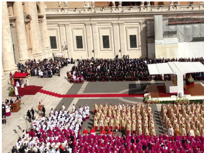
from the Installation Mass of Pope Francis at St. Peter's Square on March 19.